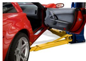
Lift arms shown with optional foot guards