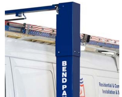
Bolt-on 24" column extensions provide added overhead clearance.